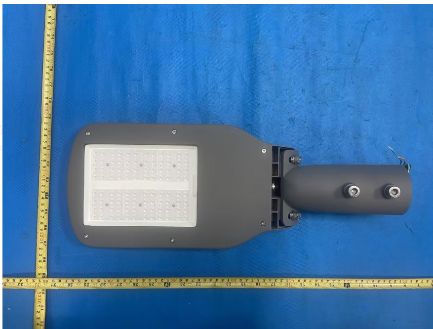
Photos of STL-60W-NS10